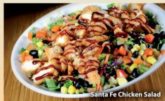
Santa Fe Chicken Salad

Santa Fe Chicken Salad $6.49 A fresh lettuce blend with black beans, diced red onions, tomatoes, mozzarella cheese, corn, carrots, red cabbage tossed with a our cool Jalapeño Ranch Dressing topped with julienned sliced crispy chicken and drizzled with our tangy Kahuku BBQ sauce.