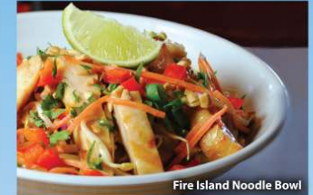
Fire Island Noodle Bowl

Fire Island $6.49 Spicy peanut sauce, grilled chicken, carrots, red onions, red peppers, cilantro, scallions, bean sprouts, and noodles topped with peanuts and a lime.