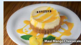
Maui Mango Cheesecake

Maui Mango Cheesecake $2.99 Sweet, rich and delicious when topped with our homemade mango puree.