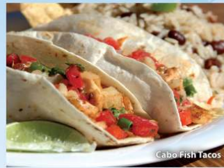
Cabo Fish Tacos

Cabo Fish Tacos $8.99 Tortillas stuffed with blackened seasonal fish, tropical salsa, cabbage, cilantro, scallions, and our cool Jalapeño Ranch Dressing. Served with Rumbi Rice (coconut rice and red beans).