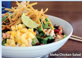
Aloha Chicken Salad

Aloha Chicken Salad $7.99 A fresh lettuce blend, red pepper, diced mango, gorgonzola cheese, red pepper, red onion, tortilla strips, with creamy mango-passion vinaigrette.